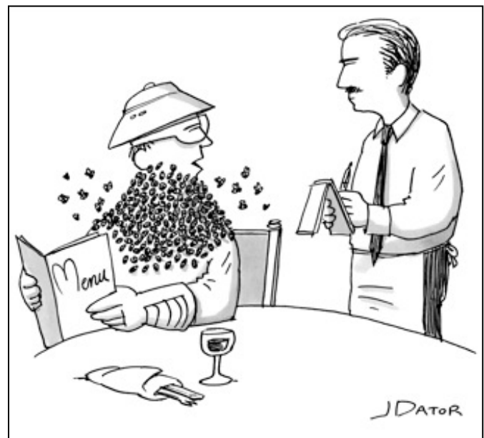
And some fresh flowers for the table. (New Yorker, January 17, 2011)

Alcoholic version: Omit spices, put honey in bottom of glass, pour in 1 ounce of bourbon, add hot tea, garnish.