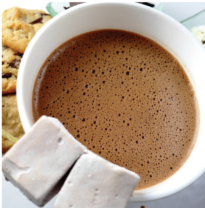
Honey Hot Chocolate by Chef Ian Bens.

Optional: Adding an ounce of brandy or liqueur will turn this recipe into a decadent adults only hot chocolate!