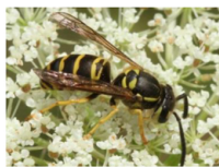
eastern yellow jacket

Unlike a wasp or hornet, a honeybee has a barbed stinger, can sting only once, and dies as a result. She will sting only when threatened. Be calm and still around bees; don't swat or wave at them.