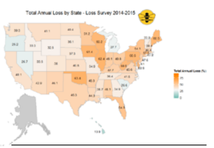
Maryland and the MidAtlantic suffered unsustainable losses.

This is the ninth year of the winter loss survey, and the fifth year to include summer and annual losses in addition to winter loss data.