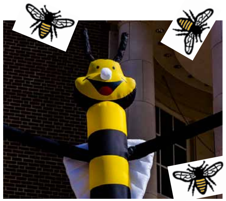
Photo: The Dancing Bee marking the entrance to MDA helps to welcome and amuse members and guests of the Maryland State Beekeepers!

Enter at the front of the building: meeting is one floor down in the auditorium.