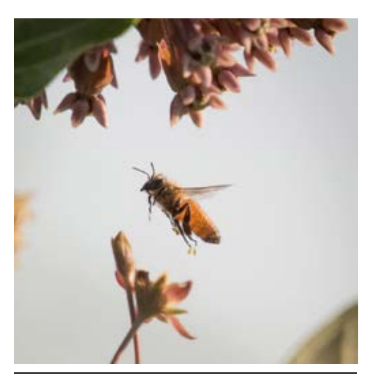
Milkweed is is not just for Monarch Butterflies: it is a honey plant, too. Milkweed blooms are sticky, however, and honey bees may fly away with pollen grains along for the ride! More at www.beeculture.com/milkweeds-honey-plants.